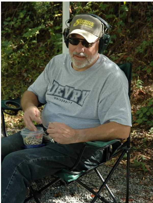
Mr. Pistol Caliber Carbine