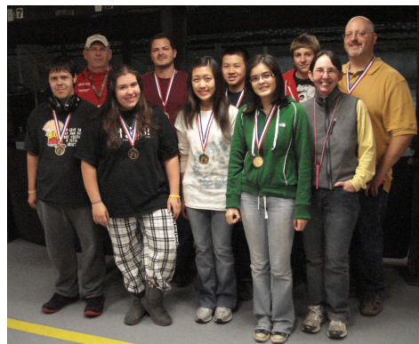
"Tyro Juniors with parents and coaches"